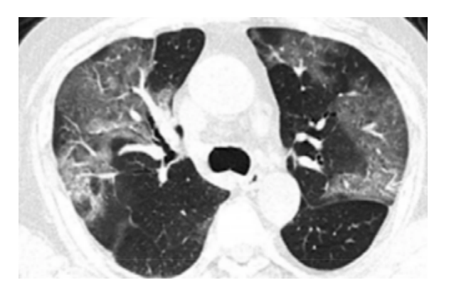
Figure 1 : COVID-19 pneumonia: section CT shows bilateral GGO

The most common abnormality was multiple mottling and ground glass opacity (964: 43.7%) (Figure 1), followed by bilateral pneumonia (799: 36.3%) (Figure 2). No cases of cavitation observed. There were significant were correlations between bilateral pneumonia, multiple mottling and ground glass opacity, bilateral patchy shadowing, and pleural effusion with death. There was a significant difference between the number of lung lobes involved in the disease and the incidence of death.